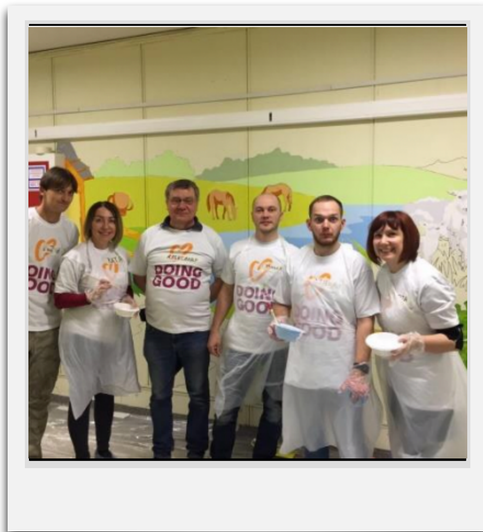
Gilat Satellite Networks, Russia Painting Wall Mural

You might consider partnering with a local non-profit organization