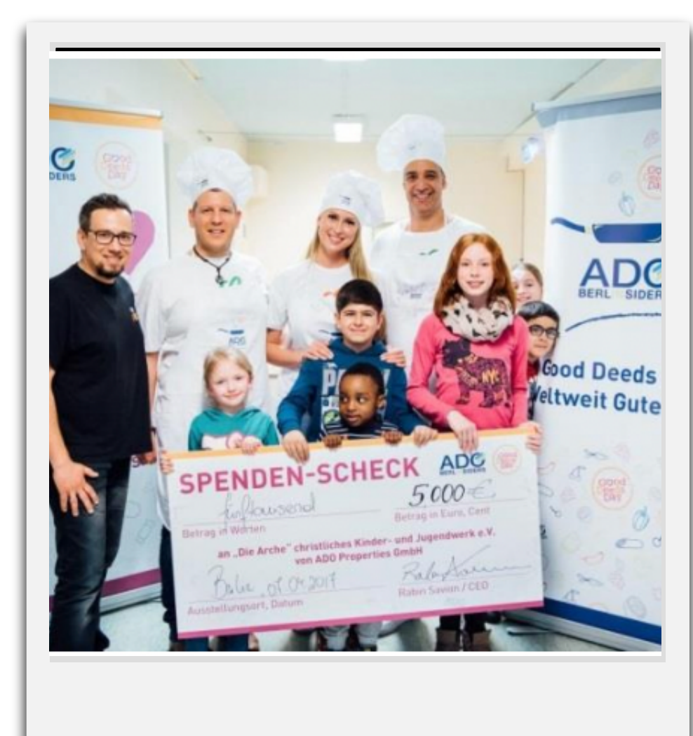
ADO Properties Company, Germany Event for children of with the Arche Charity