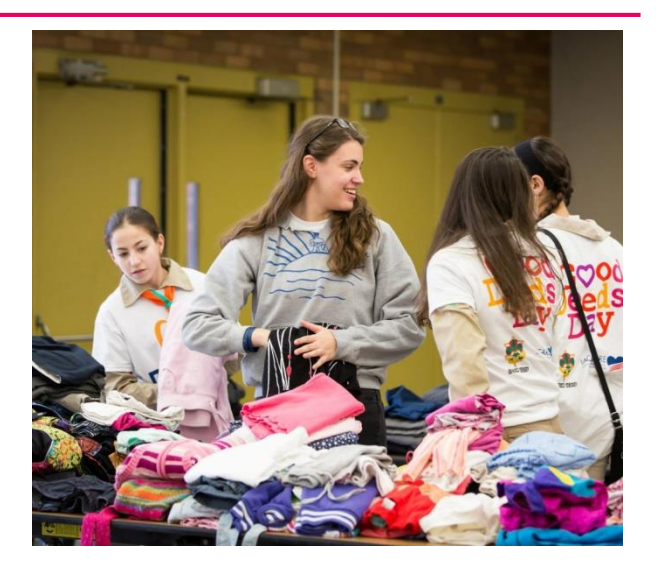
Organize a 'Give & Take' market

Collect clothing, products, food or toys for donation