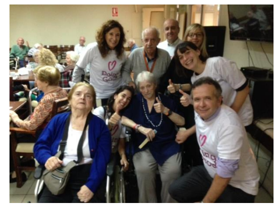
Arts and Crafts with the elderly BHI, Uruguay