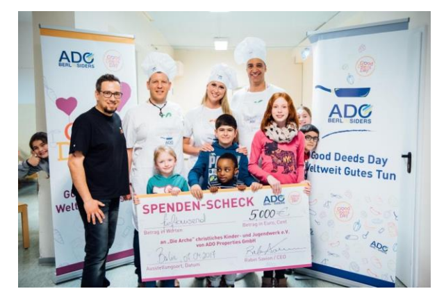
Event for the Children of the Berlin-Based Arche Charity ADO Properties, Germany