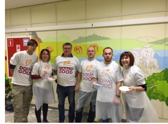
Painting a wall mural Gilat Satelite Networks, Russia

Good Deeds Day sample projects by companies around the world: