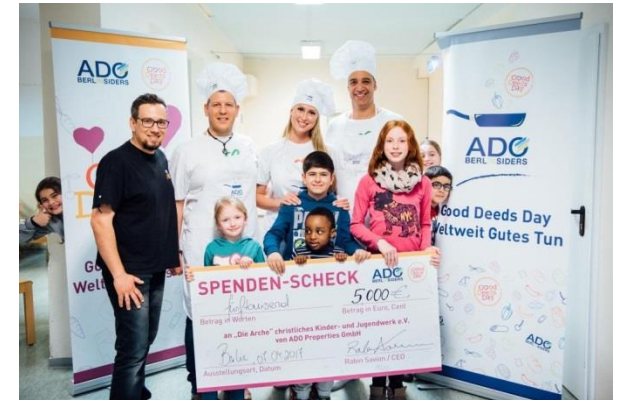
Event for the Children of the Berlin-Based Arche Charity ADO Properties, Germany