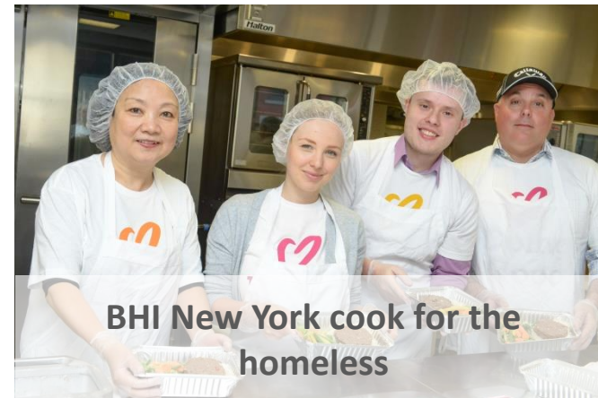
BHI New York cook for the homeless