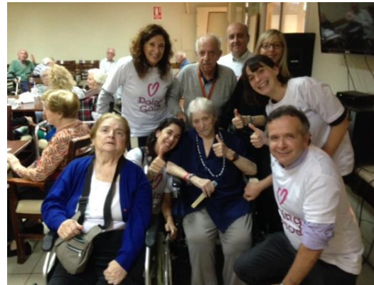
Arts and Crafts with the elderly BHI, Uruguay