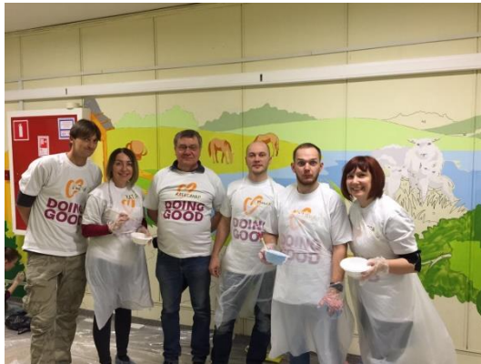
Painting a wall mural Gilat Satelite Networks, Russia

Good Deeds Day sample projects by companies around the world :