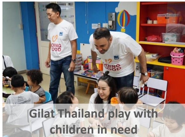
Gilat Thailand play with children in need