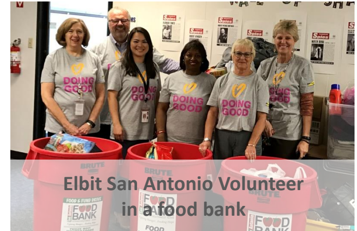
Elbit San Antonio Volunteer in a food bank