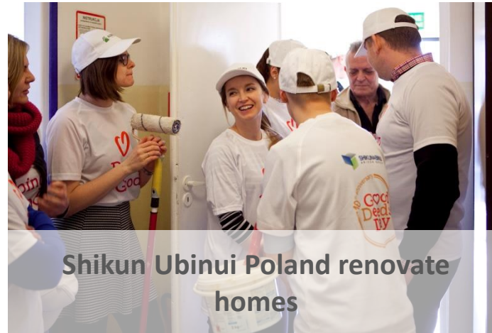
Shikun Ubinui Poland renovate homes