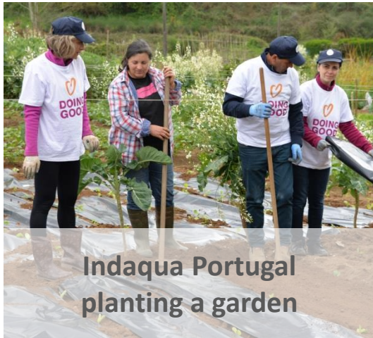
Indaqua Portugal planting a garden